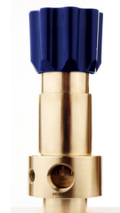
MF-301 Max Inlet - 300bar Max Outlet - 250bar Port Size - 1/2" & 3/4"NPT Flow - 2.0 Self venting