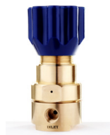
LF-300 Max Inlet - 210bar Max Outlet - 35bar Port Size - 1/4"NPT Flow - 0.06 Non venting

Call Pressure Tech to discuss your pressure regulator requirements for BIBs, hyperbaric chambers, diving bells, control panels and analyser systems.